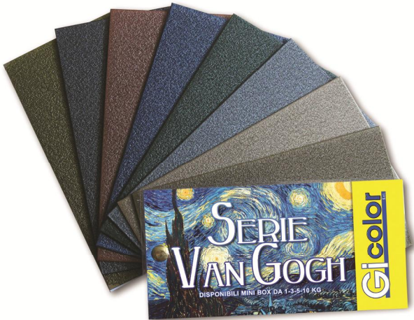
set of 8 aluminium coated panels

A FREE catalogue size A4 with aluminium decorated samples, or a set of 8 aluminium coated panels, will be delivered with every purchase order for 20 kg of product.