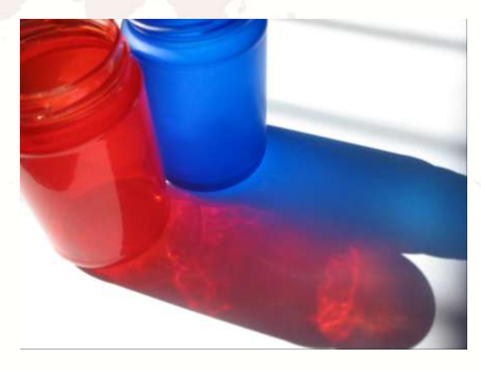
Picture 3: Jugs decorated with Glass-001 (left) and Glass-003 (right).

The Glass powders are fully valued when the surface underneath can be glimpsed, so that new and unusual effects are created; but also when double coating highlights the color.