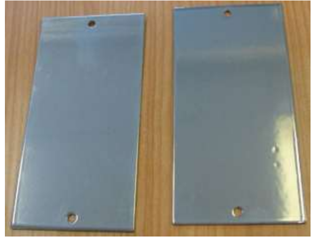
Exposed sample Reference Refrigerator (5°C – 41°F)