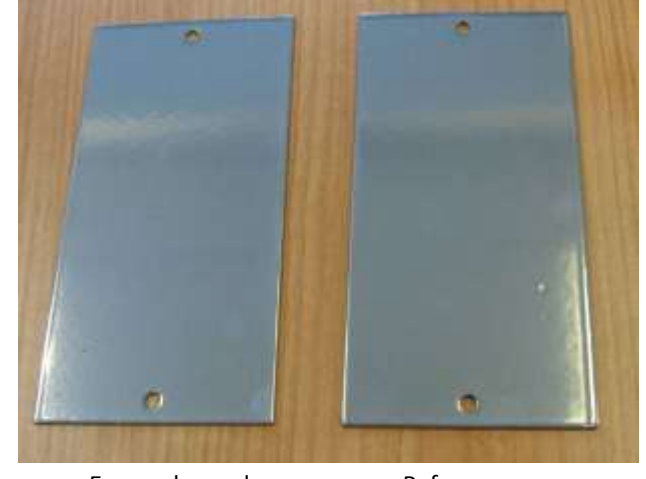
Exposed sample Reference Air-conditioned room (23°C-73°F)