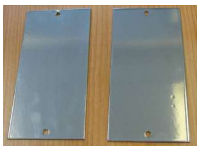
Exposed sample Outdoor