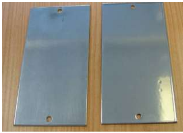
Exposed sample Reference Shaded outdoor