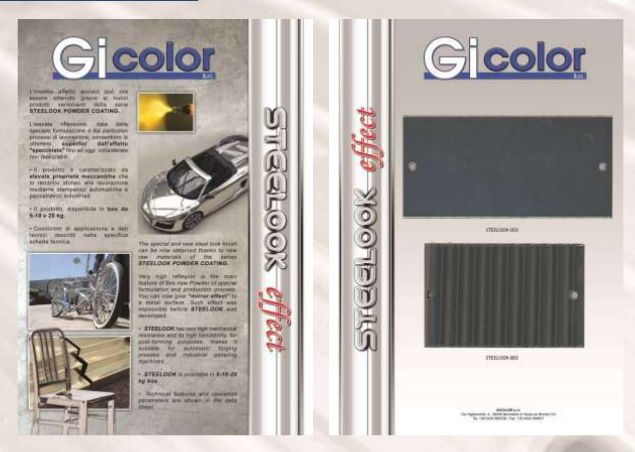
A4 catalogue with aluminum samples

P With each 20 kg product order will be delivered a copy FOR FREE of the A4 catalogue with aluminum samples.